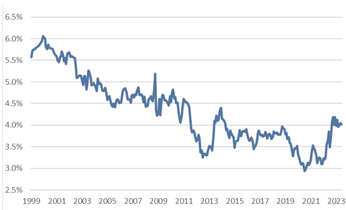
Fig. 2: “Safe withdrawal rates” increased in 2022

Of course, most investors can and will target spending rates above 4% because they are comfortable accepting some level of investment risk, bequest risk, and spending risk. A customized financial plan is the most effective way to combine these factors, along with incorporating personal nuances around taxes, asset allocation, and asset location.