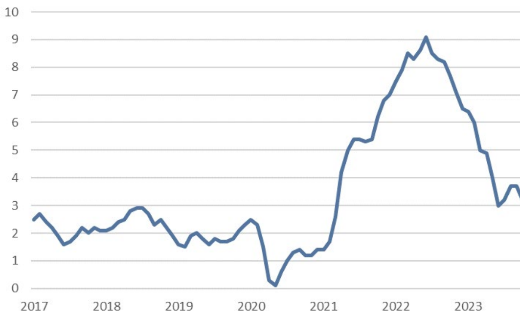
Fig. 1: CPI, year-over-year percentage change

Last week's Consumer Price Index (CPI) inflation data supported a continued pause by the Federal Reserve (Fig. 1). Inflation increased by 3.2% year-over-year, 3% on a 6-month annualized basis, and 4.1% on a 3-month annualized basis. While none of these data points are commensurate with the Fed's 2% inflation target, they provide cover for a wait-and-see approach heading into 2024.